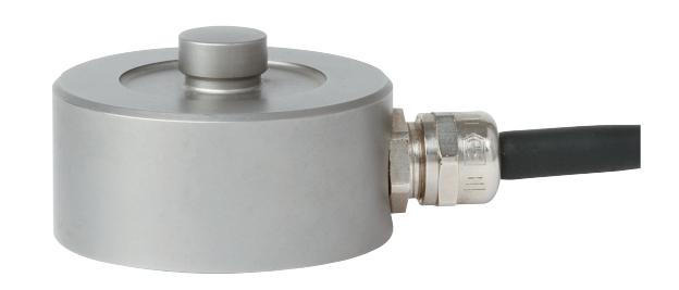
Compression force transducer, model F1211