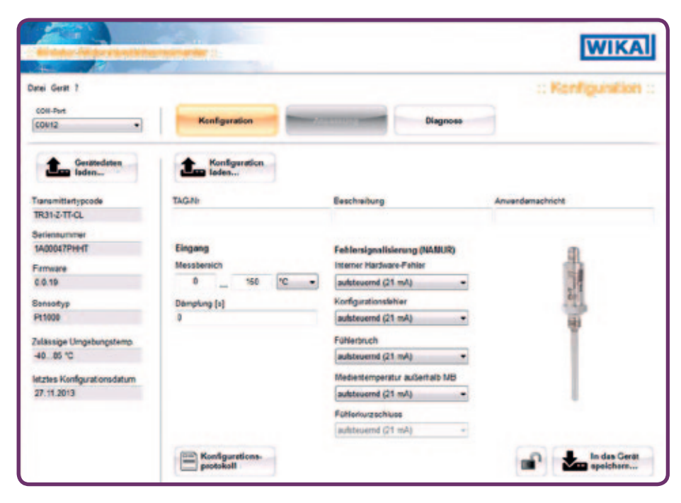
02 Individually parameterisable for integrated transmitter with free PC configuration software Wikasoft-TT

Speaking of usability, there are still a wide diversity of interfaces in the process industry. However, through its ease of operation and mobility, USB is increasingly on the rise. Similarly, suppliers are equipping their electronic instrumentation with this communication standard. Thus, the TR33/34 can be